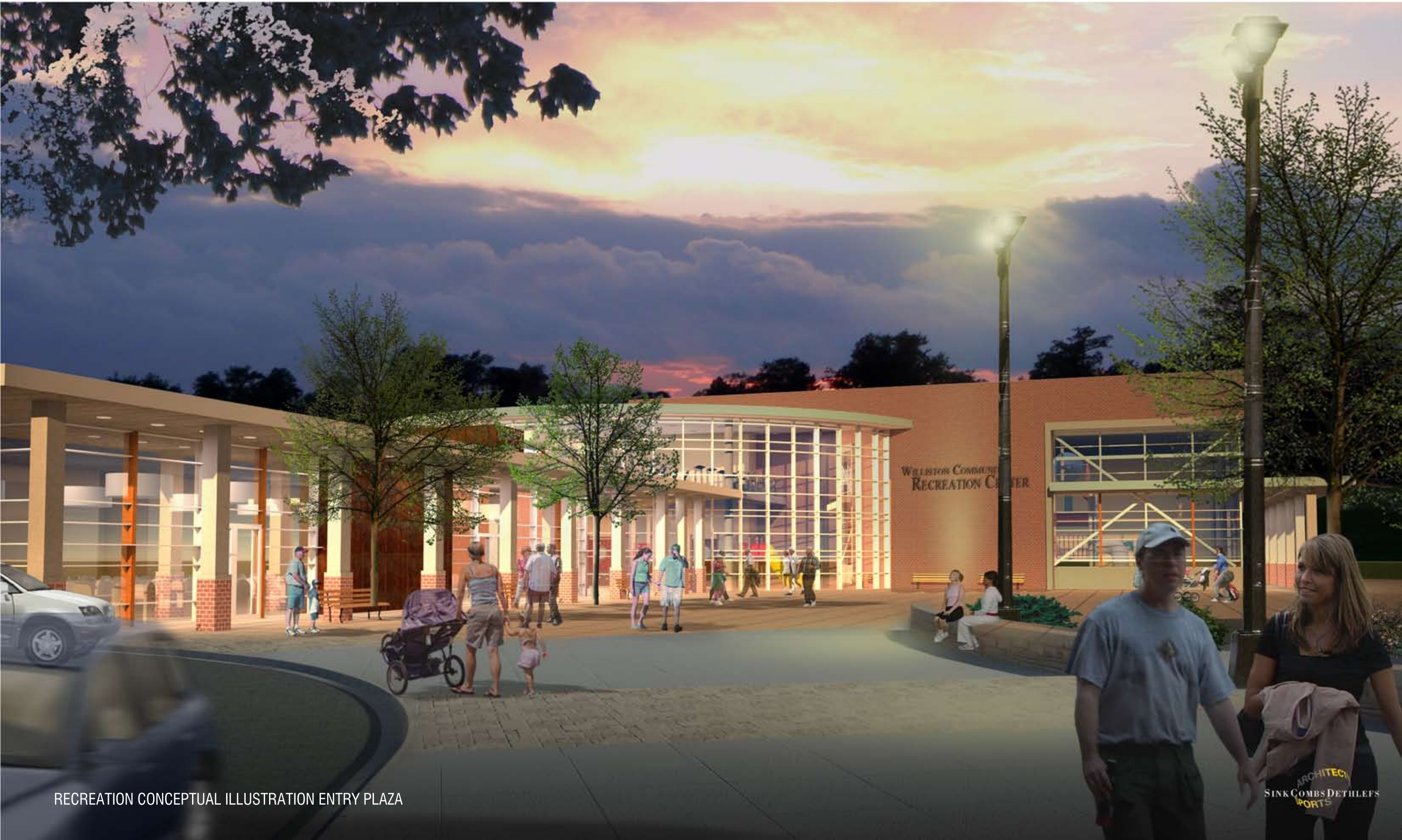
RECREATION CONCEPTUAL ILLUSTRATION ENTRY PLAZA