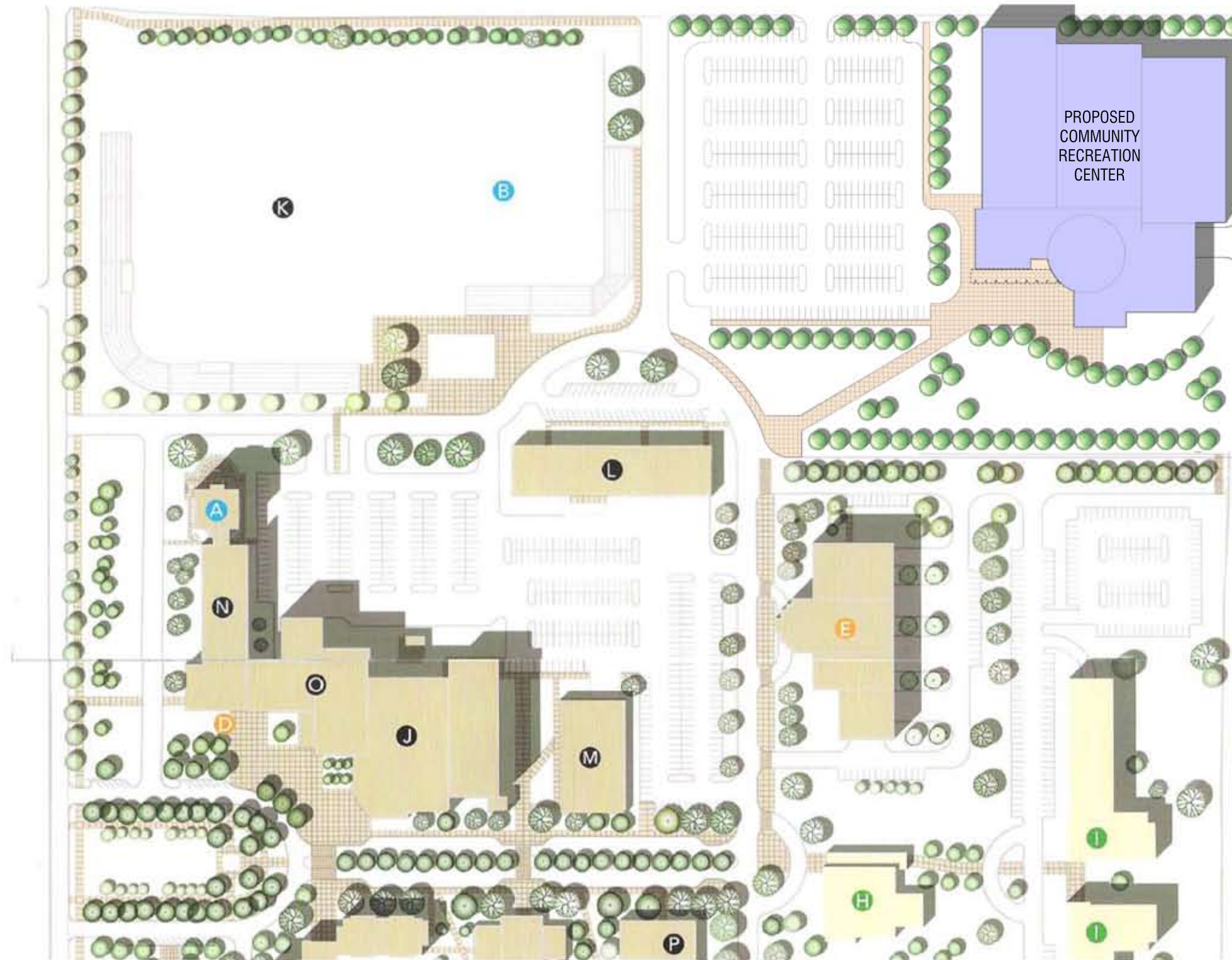
SITE CONCEPT | WILLISTON STATE COLLEGE MASTERPLAN