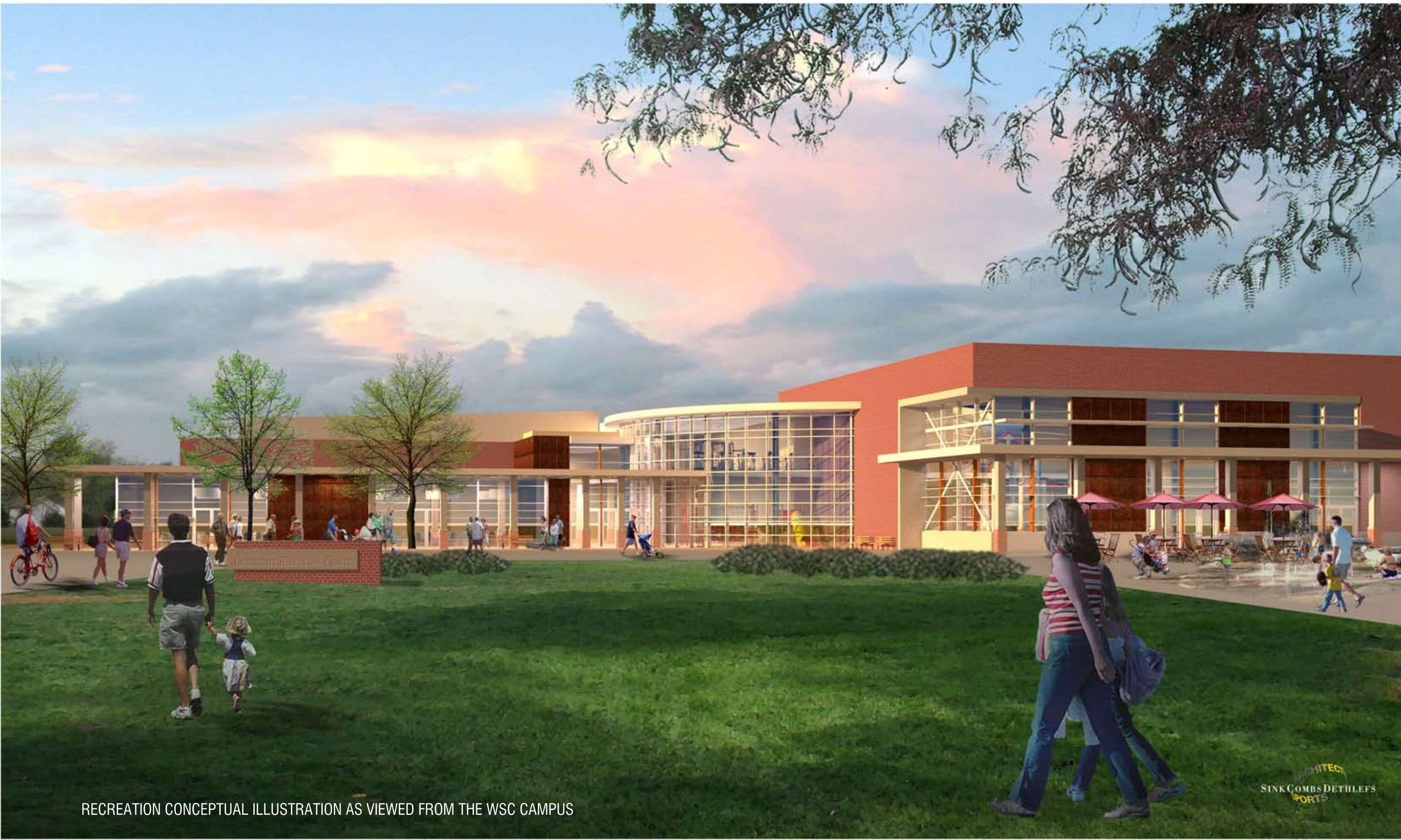
RECREATION CONCEPTUAL ILLUSTRATION AS VIEWED FROM THE WSC CAMPUS